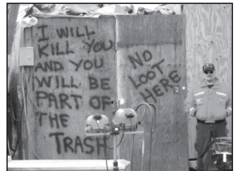
Hurricane Katrina recovery operations, Mississippi

time, he has served as a Command Duty Officer and Marine Inspector at Marine Safety Office Hampton Roads, as the Chief of Vessel Salvage Operations at Sector Mobile, Alabama during Hurricane Katrina recovery operations, and as the Team Leader of the USCG RAID Team, a group of HAZMAT experts assigned to the U.S. Army in Iraq and Kuwait. During the former assignment, he was awarded the U.S. Army Combat Action Badge, the first Coast Guardsman to receive this honor. He currently is assigned to Sector Hampton Roads as the Assistant Chief of Port Safety and Security.