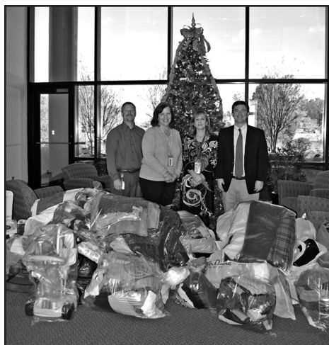
AMERIGROUP'S HARVEST FOR THE HOMELESS DRIVE